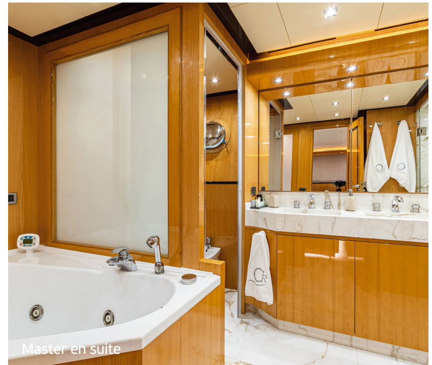
Master en suite