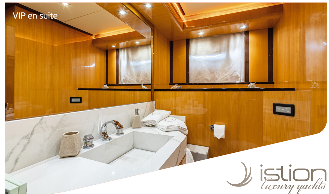
VIP en suite