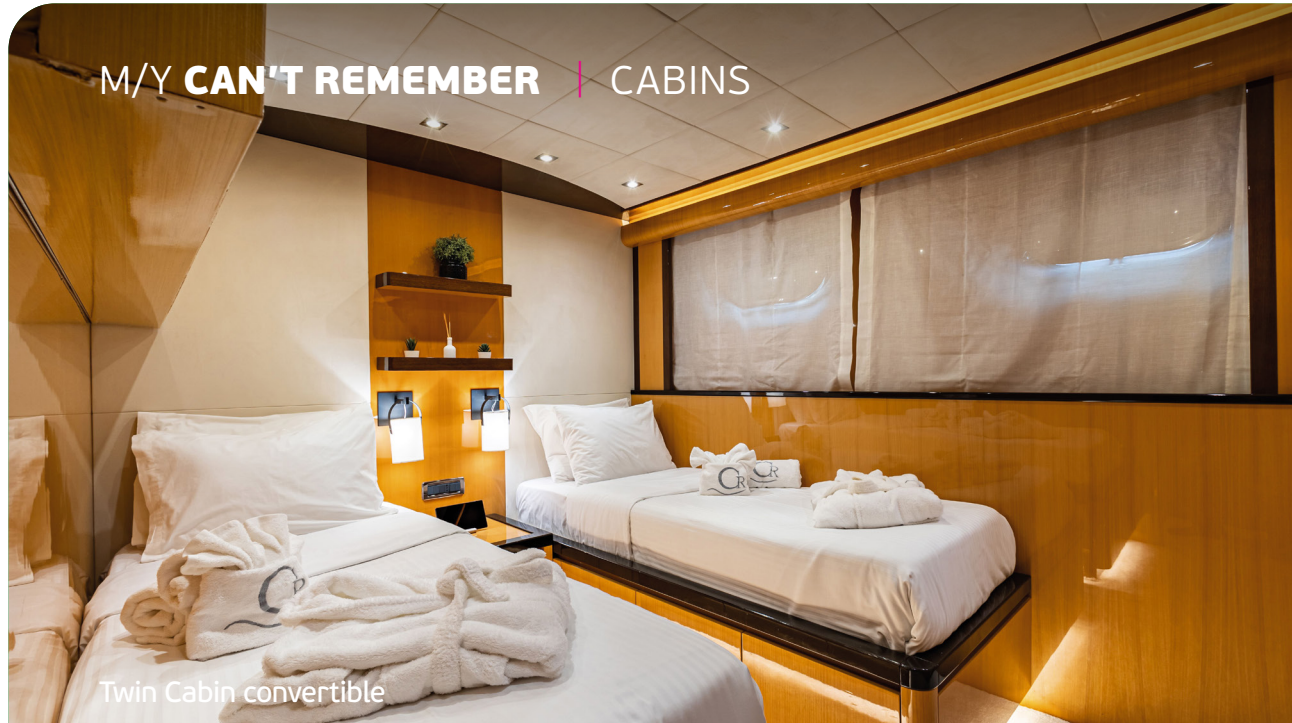
Twin Cabin convertible