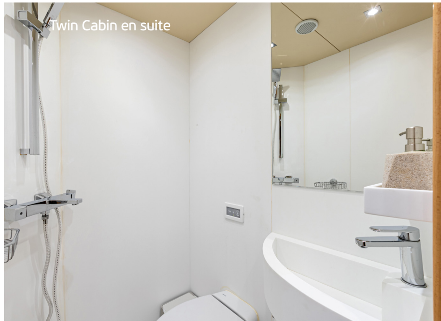
Twin Cabin en suite