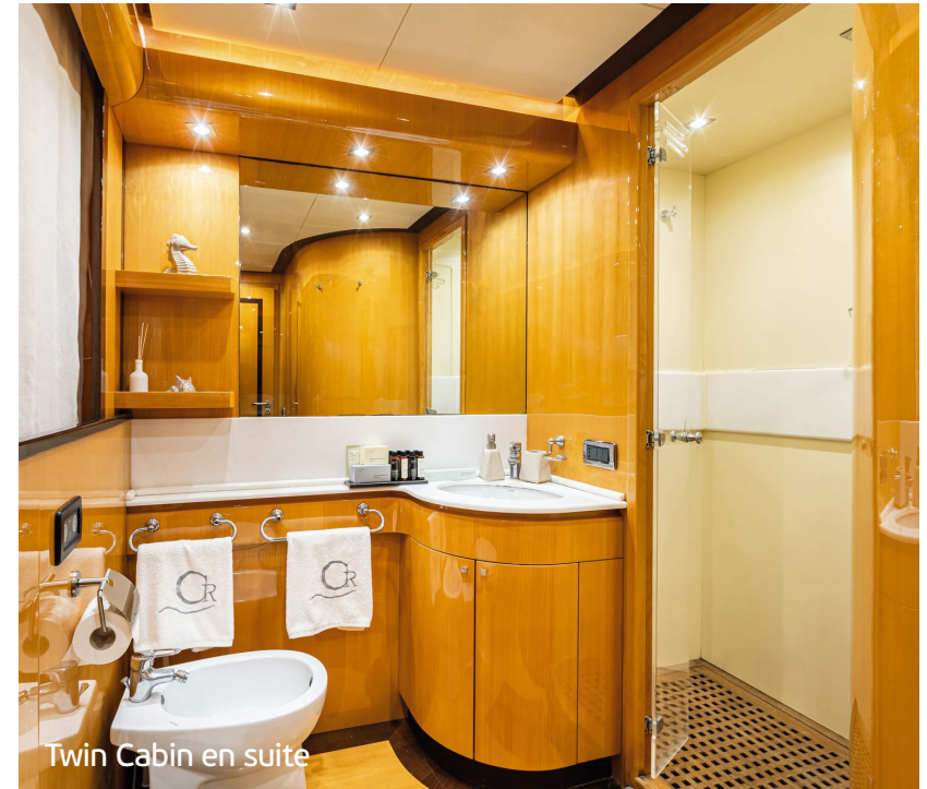
Twin Cabin en suite